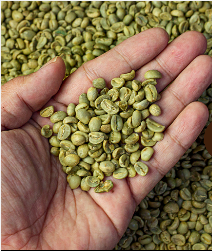
Fairly Sourced, Raw Beans